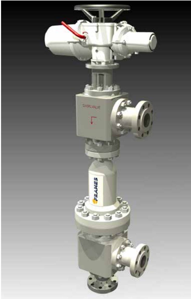
3D Model of the SwirlSep