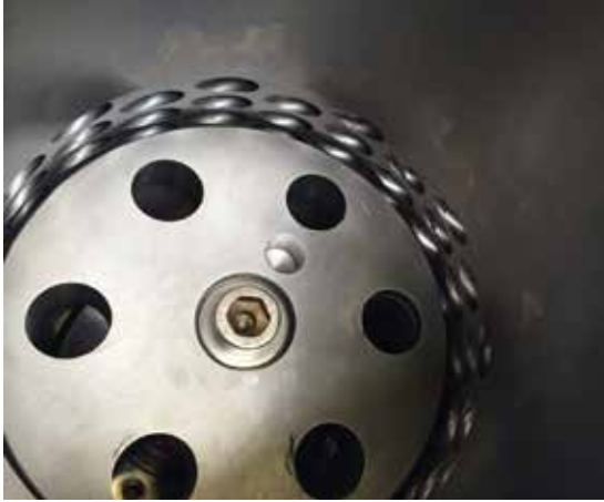
Swirl Trim Cage and Piston of the Swirlvalve